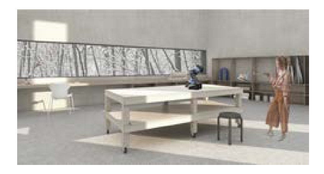
Fig. 4. Render of the studio interior shows the use of white walnut (butternut lumber) used as built-in storage and workspace that runs along the wall.

a way to warm the mostly concrete structure. Both the kitchen of the residence and the built-in storage and desk in the studio utilize walnut as their main material (see fig.4).