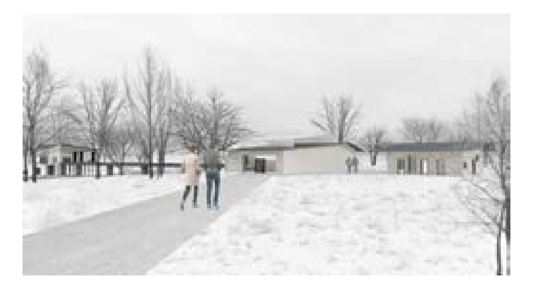
Fig. 2. An exterior view shows the forms of all three buildings as a result of diagramming.