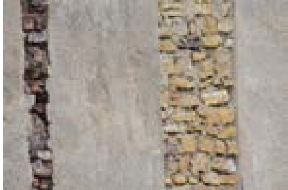
Fig. 3. Images of the site materiality. Concrete is used in conjunction with the limestone.

The concrete holds up the stone in the areas that need the most structure. As this project builds upon these materials of the ruins, the interaction of materiality was of utmost importance. By using concrete as the main materiality for all three buildings, the material becomes the mechanism that connects the past to the present.